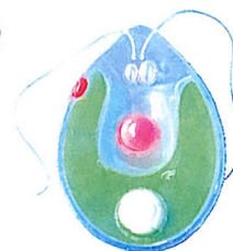
M15209 3209 J3209 Chlamydomonas model