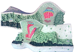
M15206 3206 J3206 Leaf structure model DIMENSIONS:460×220×160 (mm)