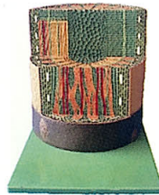
M152051 32051 China fir stem model DIMENSIONS:290×290×310 (mm)