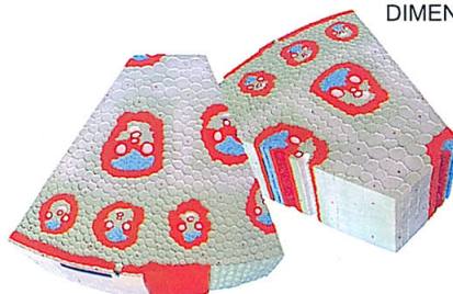
M15204 3204 J3204 Monocotyledon stem model DIMENSIONS:400×400×140 (mm)