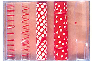
M15203 3203 J3203 Structure model of canal,sieve tube DIMENSIONS:420×300×75 (mm)