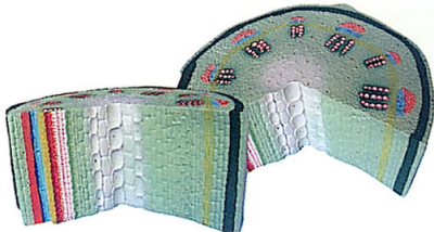
M15205 3205 J3205 Dicotyledon stem model DIMENSIONS:350×250×160 (mm)