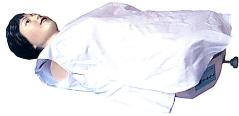
SME05: Electric model of liver and spleen palpation DIMENSIONS: 400 × 280 × 950 (mm)