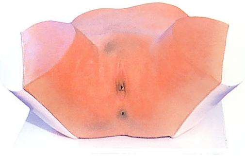
SMF011: Model of the gynecological examination DIMENSIONS: 470 × 350 × 250 (mm)