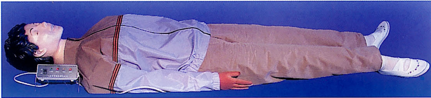
SMF001: Model of Resuscitated human body DIMENSIONS: 450 × 240 × 1680 (mm) SMF003: