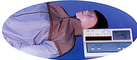
Personal computer model of Resuscitated (female and male) DIMENSIONS: 450 × 240 × 1680 (mm)